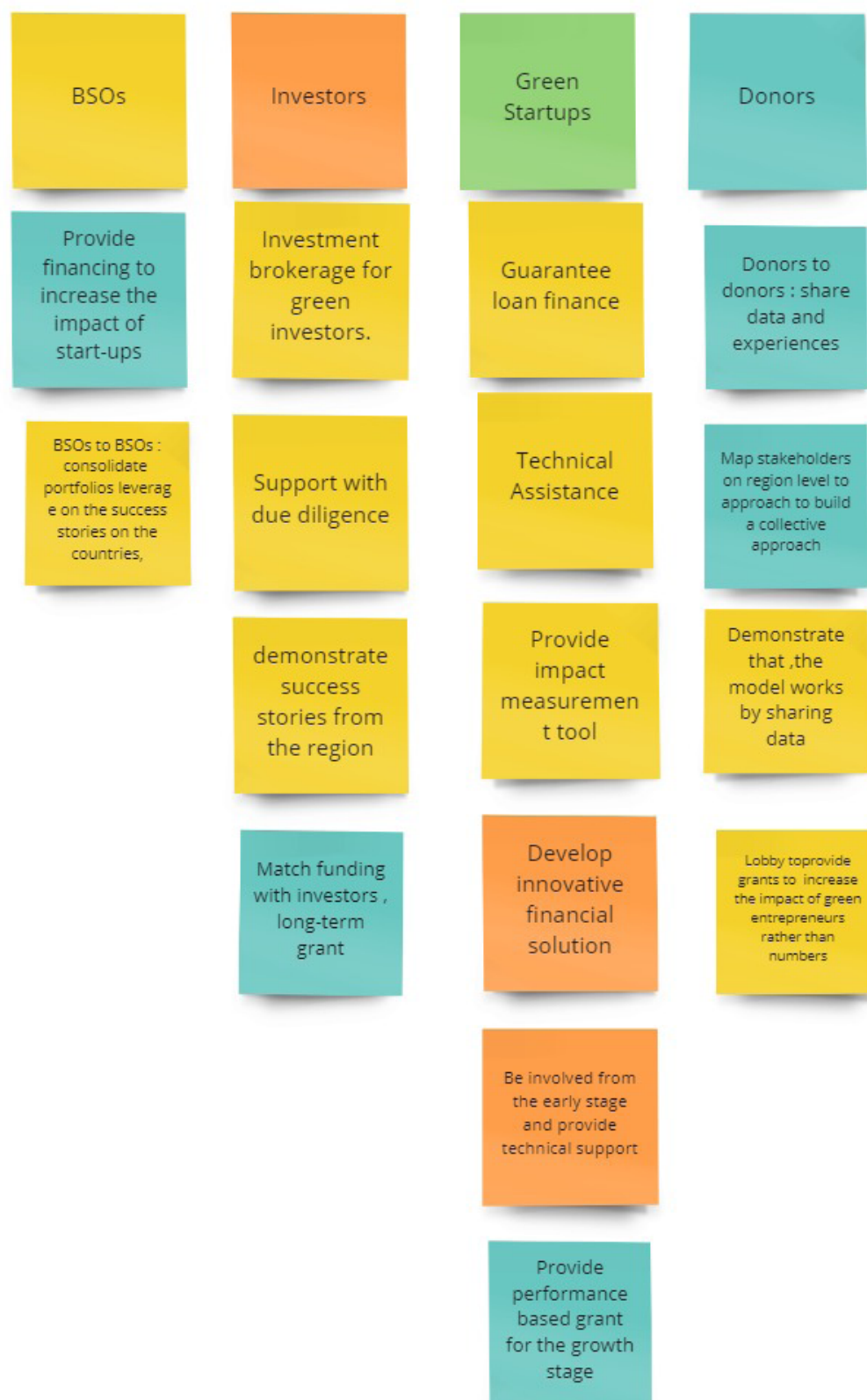
Figure 2 Interaction between different stakeholders.

The third session was held on Wednesday 9th March to explore mechanisms for partnerships and action steps to improve the match-making activities. During the session different actors expressed their desire to work together and that complementarity and coordination among different stakeholders (donors, investors, start-ups and BSOs) are missing. The figure below shows how different parties should work together to facilitate access to funding for green start-ups. Also, during the session participants mentioned the key role of the Eco-Coalition in leveraging social start-ups, introduce overseas investors, provide market data and lobby for long-term funding from donors.